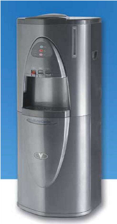
Executive Gray Cabinet