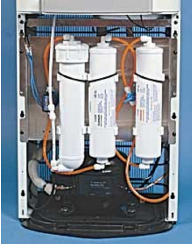
The Filter assembly is front panel accessible

Fully assembled - connection hardware included