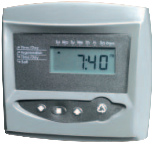
SIMPLE 4-BUTTON PROGRAMMING AND LARGE DISPLAY

Over the past two years, GE Water Technologies talked to hundreds of water treatment professionals regarding development of our next generation of controllers. You told us that a new valve controller would be a success if it were versatile, yet simple to use. We heard you loud and clear! The new Logix Controller is unrivaled in simplicity and is easier to program than any other electronic controller on the market today. In fact, it's so simple you really don't need the owner's manual – it's no more difficult than setting a digital alarm clock.