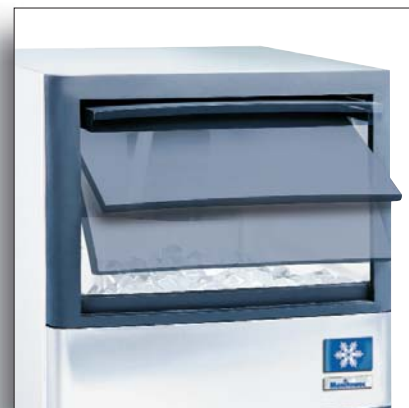
Bin door slides up and out of the way for easy access to ice