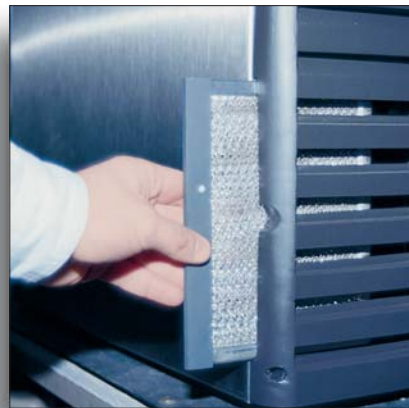
Easy access air filter