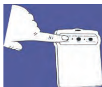
Instant Open/Close Shut-off Valve

"A home with a record of water claims may be uninsurable!" (MONEY Magazine 2003)