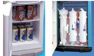
Refrigerator option* (left). The Filter assembly is front door accessible (right).