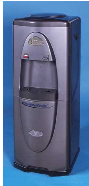
Executive Gray Cabinet